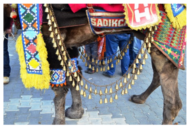
Figure 6. Small bells called as Zilgur

provided from the settlements in the region of wrestles. All those equipments, ornaments and accessories are so expensive and can cost up 1.500 (700 USD) to 15.000 TL (7.000 USD) (Culha 2008).