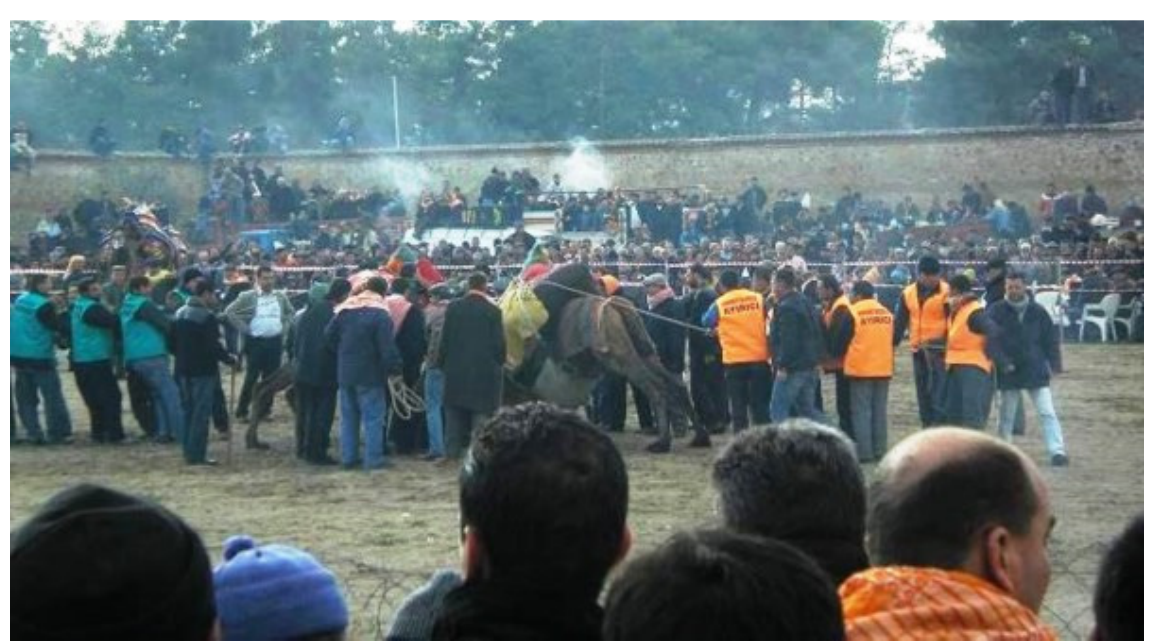
Figure 5. Two 'urganci' teams on duty in different colours of jackets