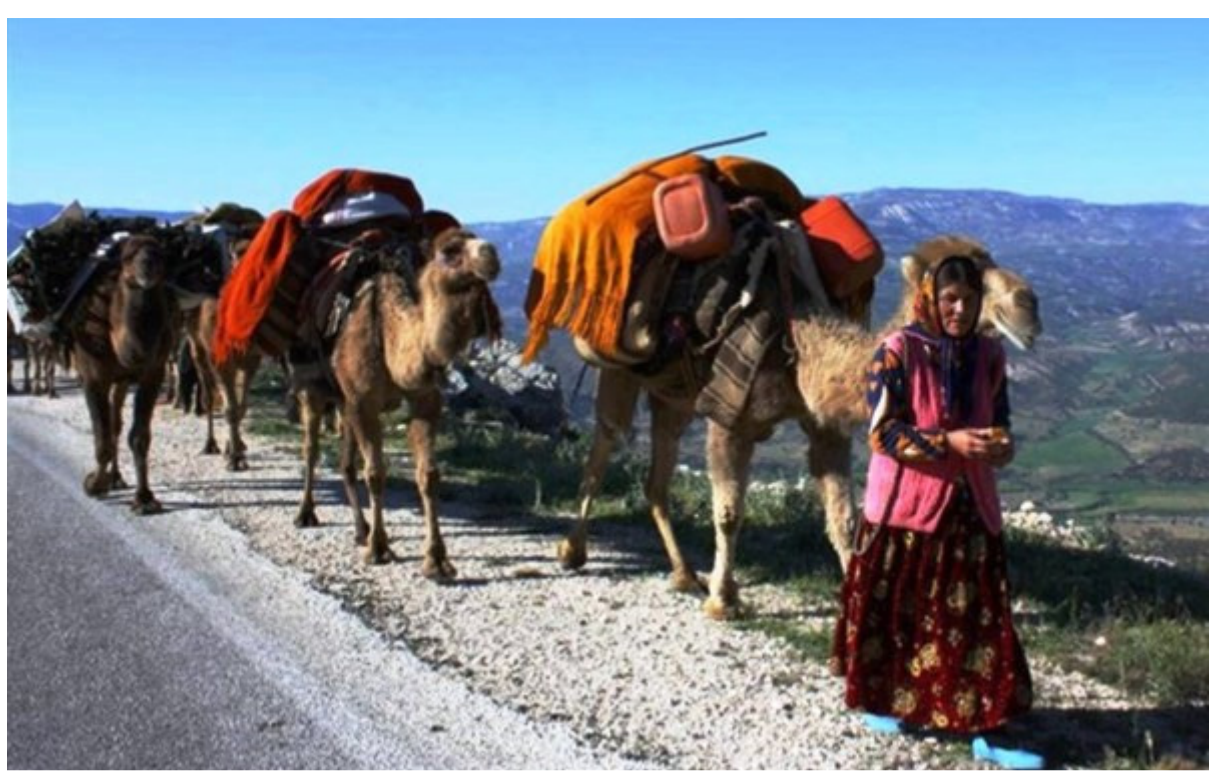
Figure 1. Nomadic Yoruk Turks migrating from plain to highland

The aim of this review is to report camel wrestling from history to present with all aspects.