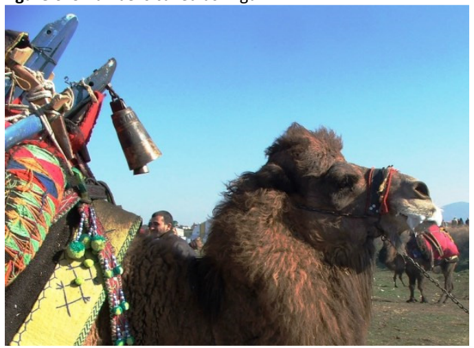
Figure 7. Bell of 'havan'