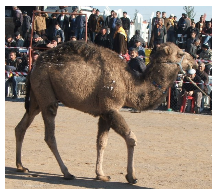
Figure 3. Maya the Female single-hump camel.