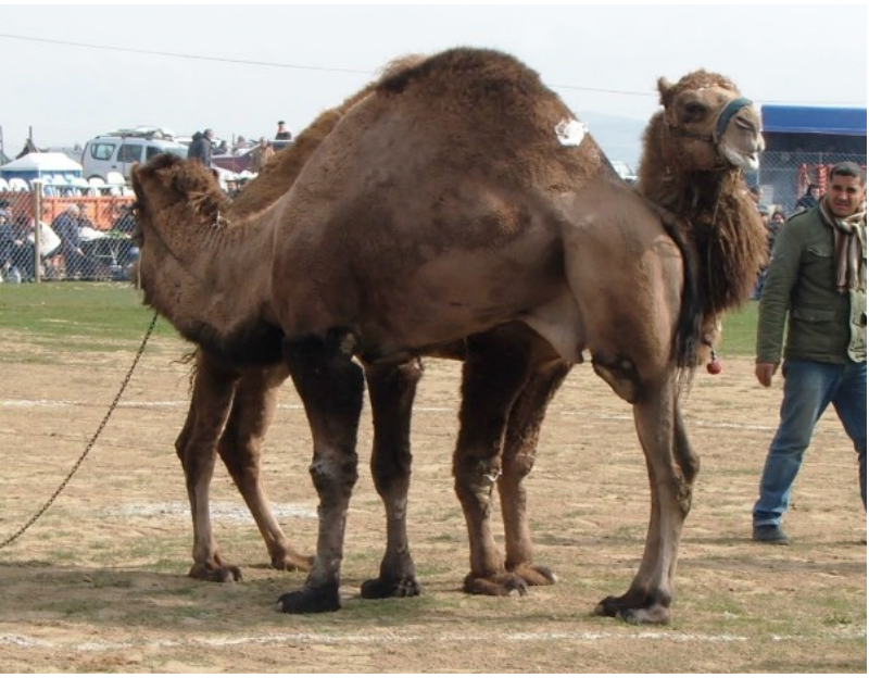
Figure 2. Two daylaks with 'badem horguc' (almond hump).